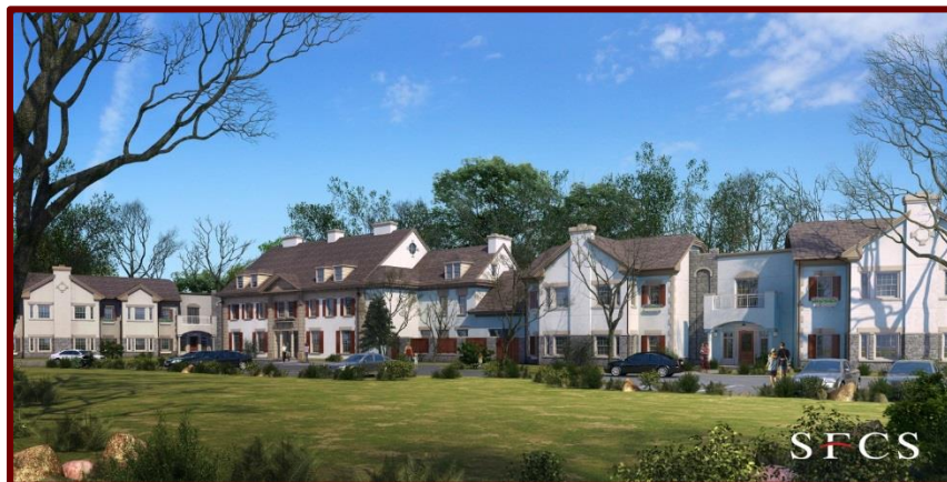
Rendering of the Mary J. Drexel Project.

The goal of this project is to construct a high quality senior-care living facility at a budgeted cost value. The owner wants the residents to have an “at-home” feeling instead of the traditional institutional/hospital feeling as many senior-care facilities have.