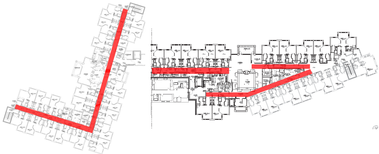
Figure 2 – Floor Plan layout for West Wing (left) and East Wing (right)

The extra efforts could have been avoided if the MEP systems were fabricated at an off-site fabrication facility and then transported to the construction site. The main focus of implementing MEP prefabrication will be placed on common corridor racks for both wings since they each have identical layouts respectively as shown in Figure 2 below.